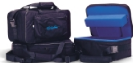
Instant Replay Padded Gig Bag